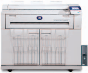
Digital Copier/Printer with Scan-to-Net