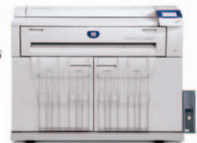
Digital Copier/Printer with the WideFormat Scan System